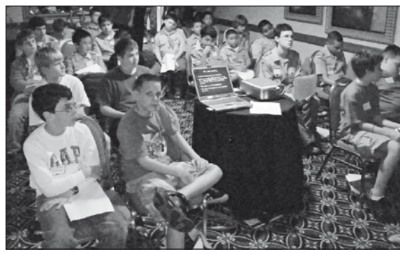
Boy Scout Clinic - Saturday