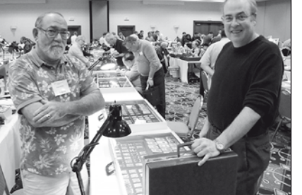
Coin Dealers Enjoy the Show...